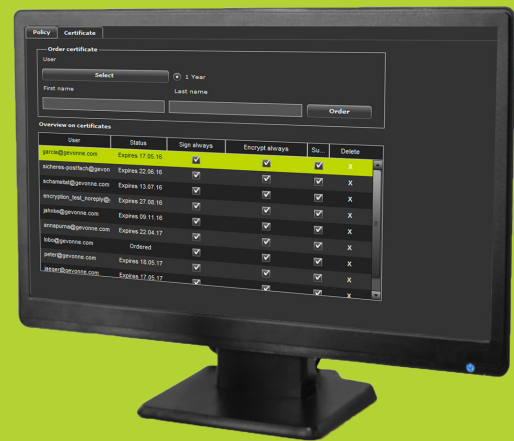
Fig: The administrator can order new certificates through the Control

If a client needs new certificates for a user, the administrator can order these through the Control Panel with just a few clicks. The advantage: The period and the type of the certificates (for signing and/or encryption) can be selected easily. The subscription model allows for a permanent buying process of the certificates.